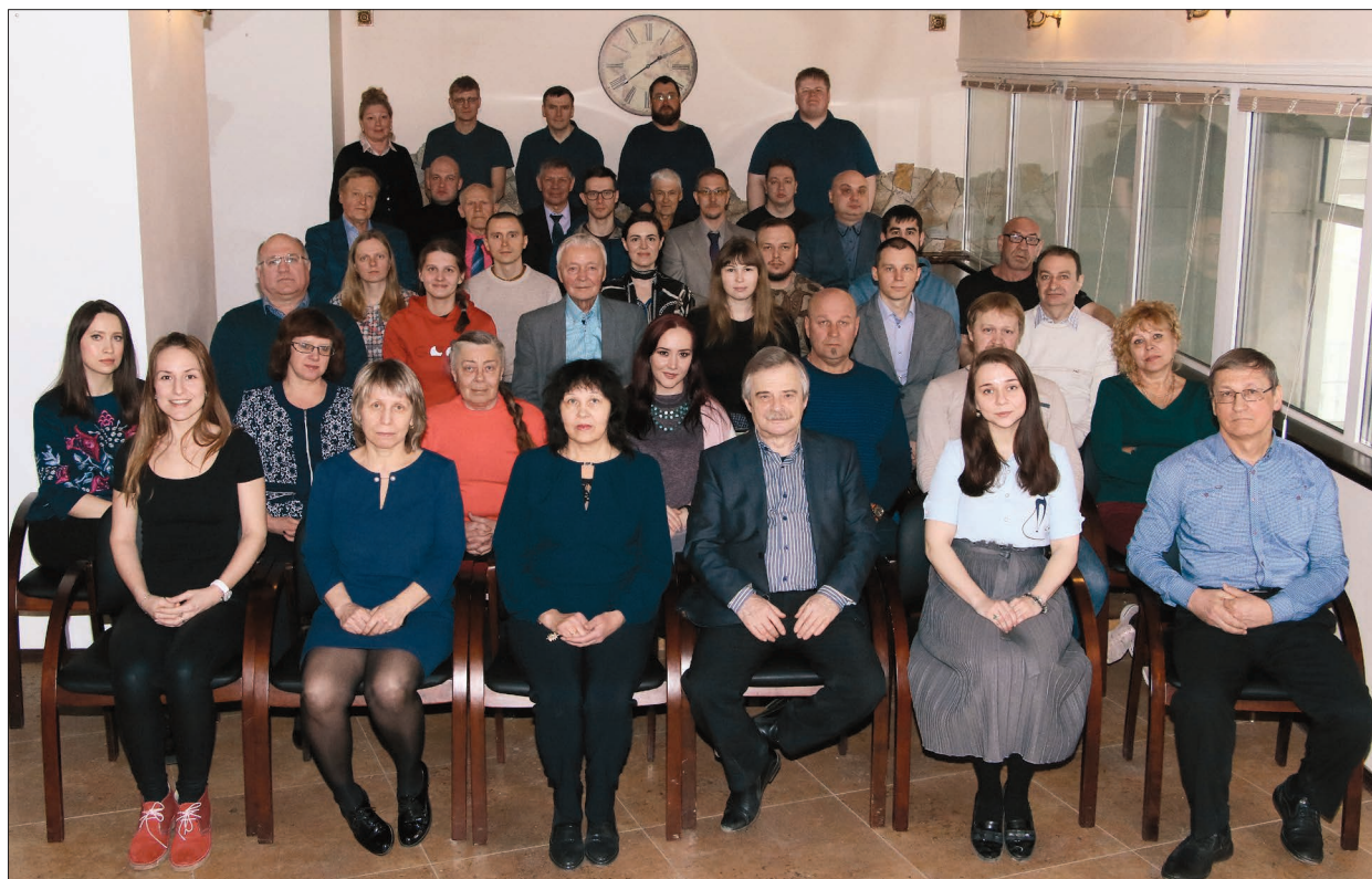
Fig. 2. The ECI research staff, Tyumen.

expertise and youth vigor (Fig. 2). The breadth of the institute's research lines is remarkably expressed in its structure, which includes four laboratories titled "Cryogenic processes", "Cartographic modeling and forecast of the state of natural cryogenic geosystems", "Natural gas hydrates", "Heat and mass transfer phenomena", and a scientific project "The methodological framework of cryospheric sciences" (Fig. 3).