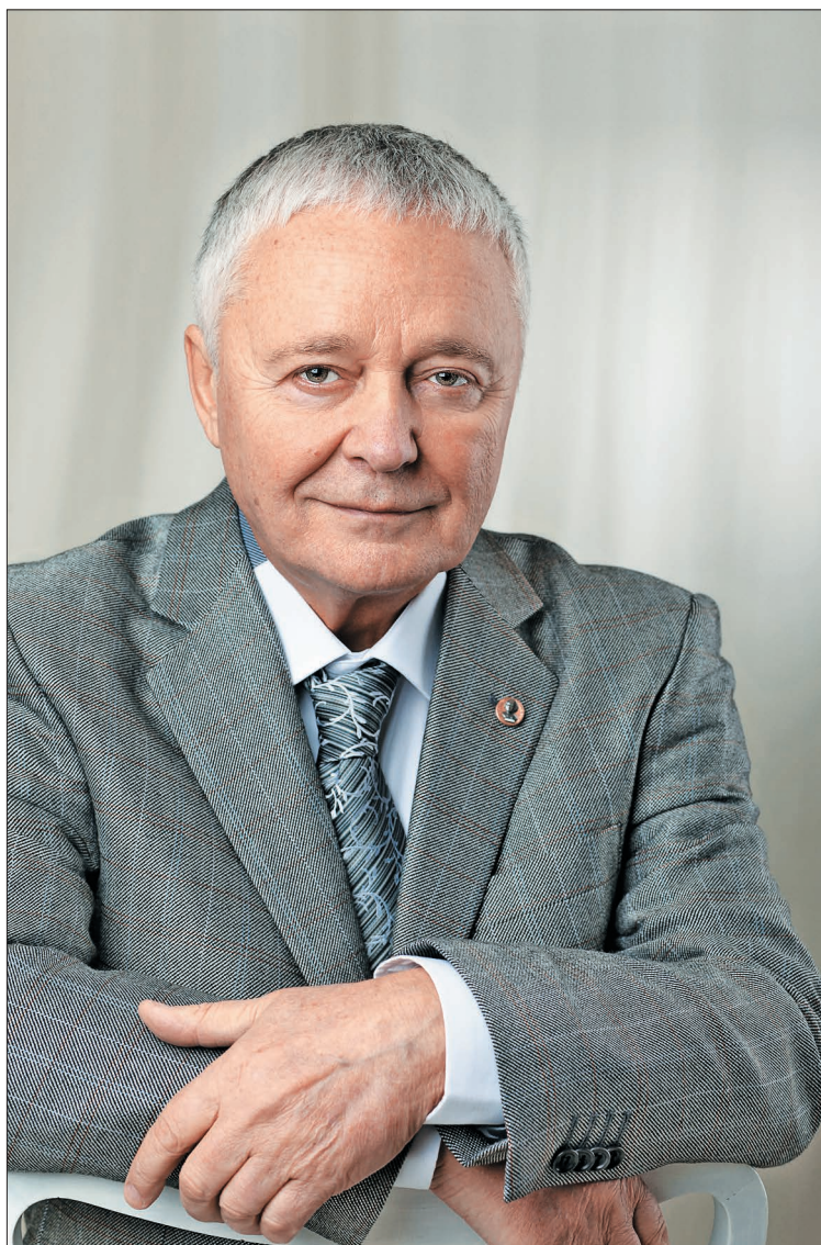
Fig. 1. Academician Vladimir P. Melnikov, the founder of the Earth Cryosphere Institute, SB RAS and its director from 1991 to 2014, the organizer and permanent editor-in-chief of the “Earth’s Cryosphere” journal.

advance for observations on Yamal and Gydan, and to get a bird’s eye view of all the elements of tundra landscapes typical of permafrost regions (cryolithozone).